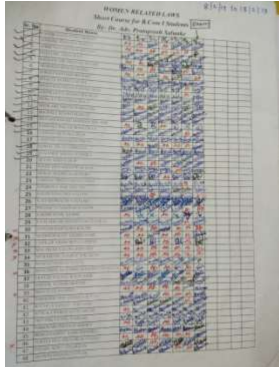
Orientation of Swayam Courses: Economics and Commerce, and Psychology Departments organized orientations of SWAYAM add-on Courses to students in the month August 2018.