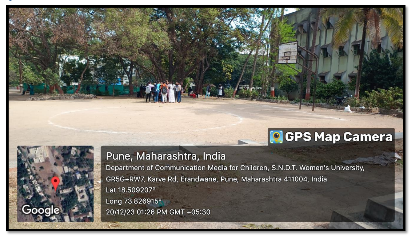
Sports Ground 2